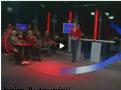
Richtig handeln beim Autounfall